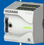
MICRO PROFINET I-Device