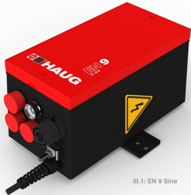
III.1: EN 9 Sine